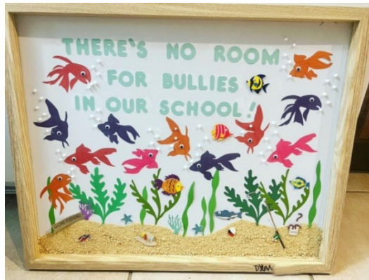
Dylan, 9 (First Place, Age 7 to 9 Category)