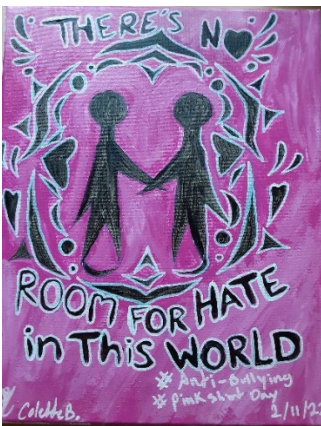
Colette, 13 (First Place, Age 12 to 19 Category)